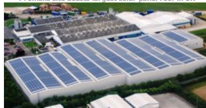
Promens site boasts largest solar panel roof in UK

"Getting this site online before the August deadline was a considerable achievement and it is a real credit to Grupotec, for their speed and coordination during design and construction, and to Promens as a company for their commitment to the project and a willingness to do what was needed to get it completed."